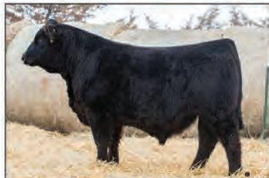
RAINS KINGSLEY K259 REG: ASA# 4163879 W/C EXECUTIVE ORDER 8543B RAINS MISS FLO F833