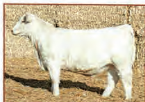
#2130 LT Inception x PCC Ms Andree 306C Balanced with Style | Homozygous Polled

FC RIDGE 2092 P ET Born: 3-4-22 PVR Ridge 7142 x LT Brenda 2184 Pld BW: 88 lbs. AWW/R: 858 lbs./ET Homozygous Polled BW: -3.2 WW: 62 YW: 121 Milk: 28 REA: 0.80 TSI: 267.15 EPDs Rank Top 9% BW | 10% TSI | 15% CE, YW, CW