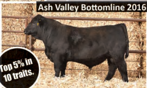
Ash Valley Bottomline 2016