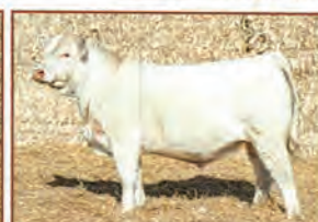
#2033 SAT Boomtown x LT Sundance x DCR Solution EPDs Top 3% YW 1.5% TSI 1.6% TA, REA 1.8% WW