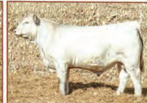
#2114 WCR Tank 002 x JLS Total Reward x BHC Top Pro EPDs Top 4% WW | 6% YW | 8% REA Homozygous Polled

Offering 50 Performance Driven Charolais Bulls and a Fancy Set of Red Angus Heifers Bred Charolais