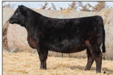
RAINS MISS BOZEMAN K260 REG: ASA# 4163887 BRIDLE BIT MR D6104 RAINS MISS FA F804