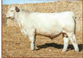
#2056 LT Affinity x LT Patriot x Cigar Balanced EPD Profile