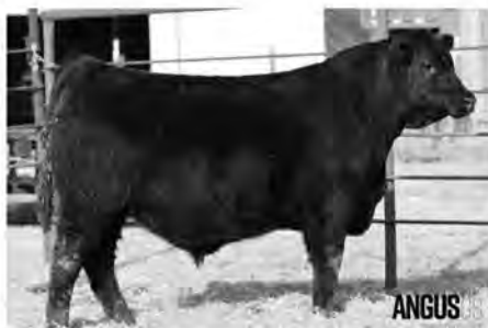
20318370 • Sire: Growth Fund • 2/4/22 • Angus CED 11; BW .3; WW 75; YW 141; Marb .43; RE .54; $B 141; $C 257