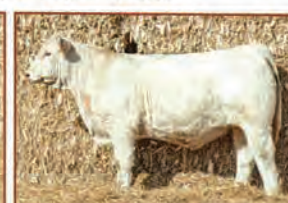
#2037 LT Patriot x LT Venture x LT Santana BW: -2.0 EPD | Homozygous Polled