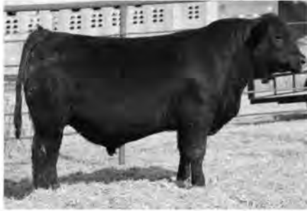
4147874 • Sire: Big Timber • 9/1/21 • 3/8 Sim Angus CED 12; BW -0.2; WW 72; YW 110; Marb .33; RE .41; API 125; TI 73