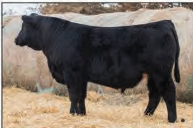
RAINS JR LONGEVITY K2107 REG: ASA# 4163833 ASR LONGEVITY F8224 JMB JANE TOP GAME 544

OFFERING: 36 BLACK + RED SIMMENTAL & SIMANGUS™ BULLS 20 BLACK + RED SIMMENTAL & SIMANGUS™ HEIFERS