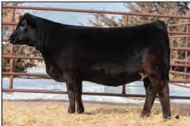
RAINS MISS KAZOWIE K219 ASA# 4163852 THSF LOVER BOY B33 MMMM RAINS MISS ME O MY H100