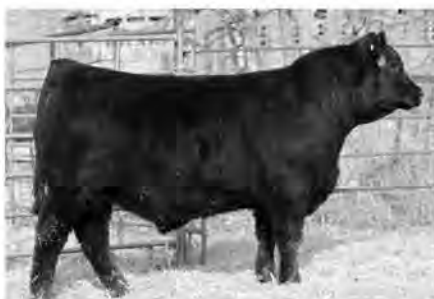
4147874 • Sire: Main Event • 2/4/22 • 1/4 Sim Angus CED 11; BW 1.5; WW 80; YW 128; Marb .35; RE .50; API 109; TI 78