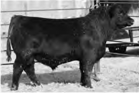
4147886 • Sire: Big Timber • 8/28/21 • 3/8 Sim Angus CED 12; BW -0.2; WW 74; YW 112; Marb .33; RE .41; API 126; TI 74