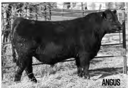
20311494 • Sire: Plus One • 2/14/22 • Angus CED 9; BW 1.8; WW 67; YW 124; Marb .86; RE .72; $B 166; $C 256