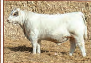
#2088 LT Affinity x LT Brenda 2184 Pld EPDs Top 1% BW | 10% CE | 20% MB