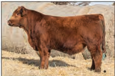
RAINS ALL AMERICAN K252 REG: ASA# 4163915 KBHR ALL AMERICAN G104 RAINS MISS BEEF KING G906