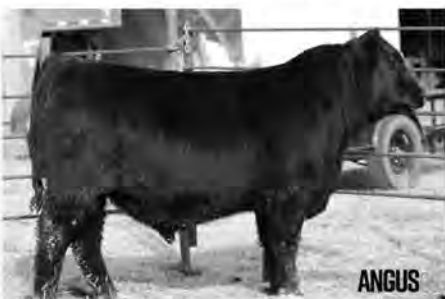
20318368 • Sire: Growth Fund • 2/6/22 • Angus CED 4; BW 2.2; WW 71; YW 128; Marb .31; RE .55; $B 140; $C 247