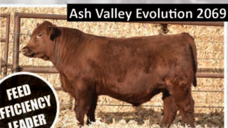
Ash Valley Evolution 2069