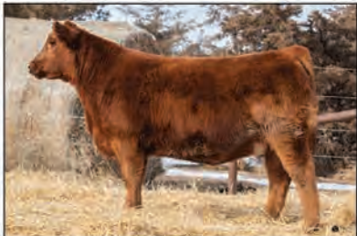
RAINS MISS JR OUTCROSS K280 REG: ASA# 4163876 FOCR MR F821 RAINS MISS HOT IRON D680