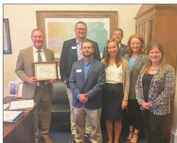
Rep. Tracey Mann, left, was recently presented the Friend of Farm Bureau Award.