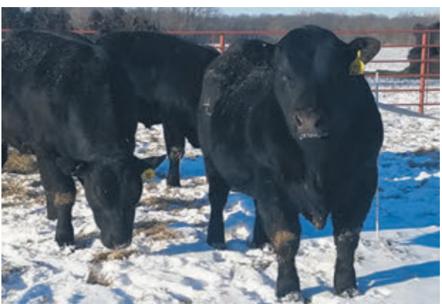
The 31st Lyons Ranch Angus Bull Sale was held March 4.