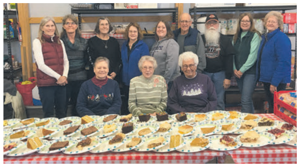
There was plenty of good help to make sure the attendees of the Lyons Ranch Angus Bull Sale were well-fed.