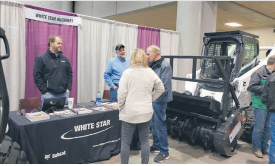
White Star Machinery was one of the many exhibitors at the 30th Topeka Farm Show, held January 8-10 at the Expocentre.

export business, but the markets seem to go up and down just like always, so it seems we can do without the information.