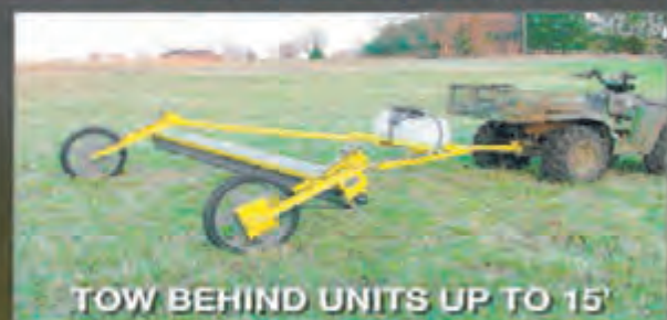
TOW BEHIND UNITS UP TO 15'