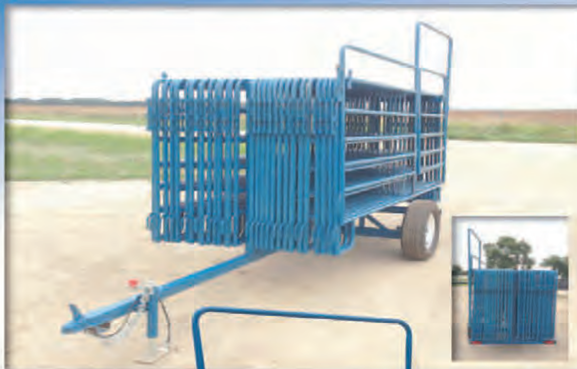
Panel Trailer Model 1-0118A