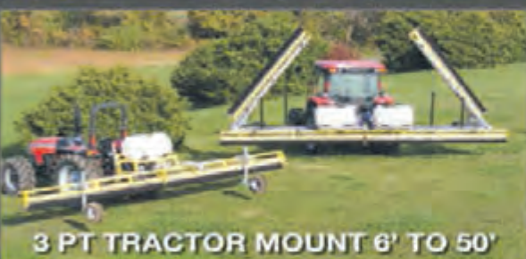
3 PT TRACTOR MOUNT 6' TO 50'