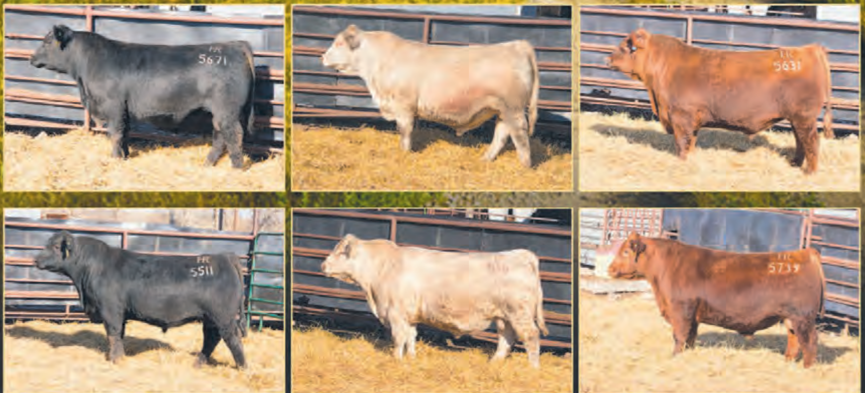
Here is a sample of our 2017 Sale Bulls, Check out web site mid February for updated photos and videos.

For more than 20 years this has proven to be a successful path for hundreds in the HPR Family. On your journey for genetic solutions you will find Harms Plainview Ranch is a comfortable place to call home.