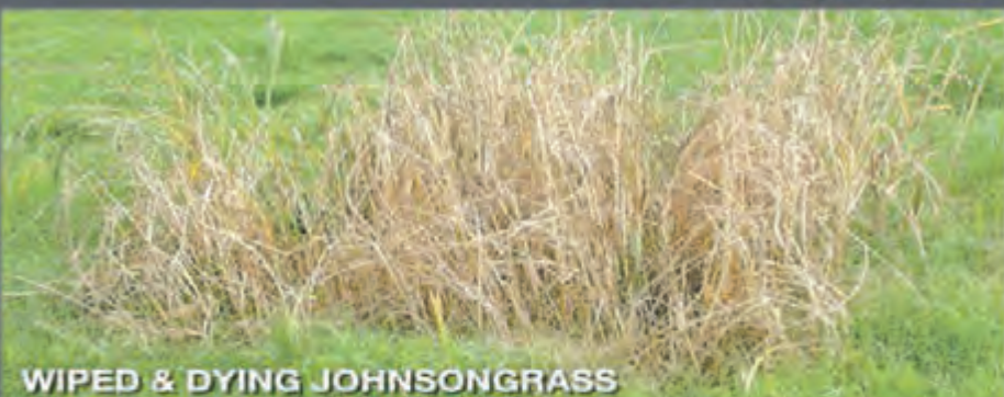
WIPED & DYING JOHNSONGRASS

"The Fast, Efficient and Economical Way"