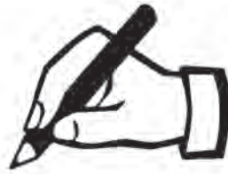
FIGURE YOUR COST HERE: