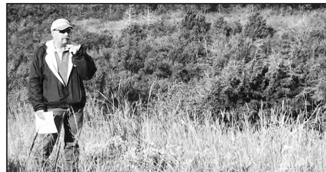
District Conservationist Tracy Freeman discussed the EQIP program at the 25th Wabaunsee County Ranch and Range Tour.

Education materials provided to tour attendees are available to the public by visiting the Extension Office (first floor of Courthouse in Alma, 215 Kansas Ave).