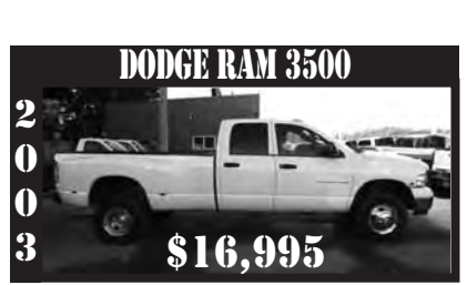
4 door, 4x4, SLT, Cummins Turbo Diesel, Nicely Equipped!