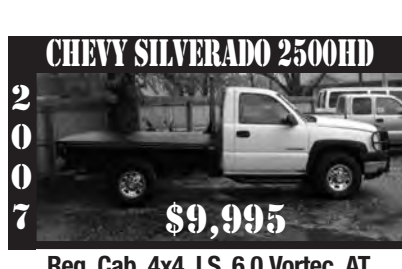
Reg. Cab, 4x4, LS, 6.0 Vortec, AT,