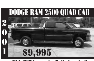
4X4, SLT Laramie, Fully Loaded!