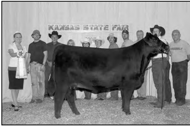
McCurry Bros. Angus exhibited the overall supreme champion beef female shown at the 2008 Kansas State Fair completed recently in Hutchinson. This was the first year for a supreme champion animal to be selected from the open class entries.

SUBSCRIBE TO GRASS & GRAIN 785-539-7558 or online at: grassandgrain.com