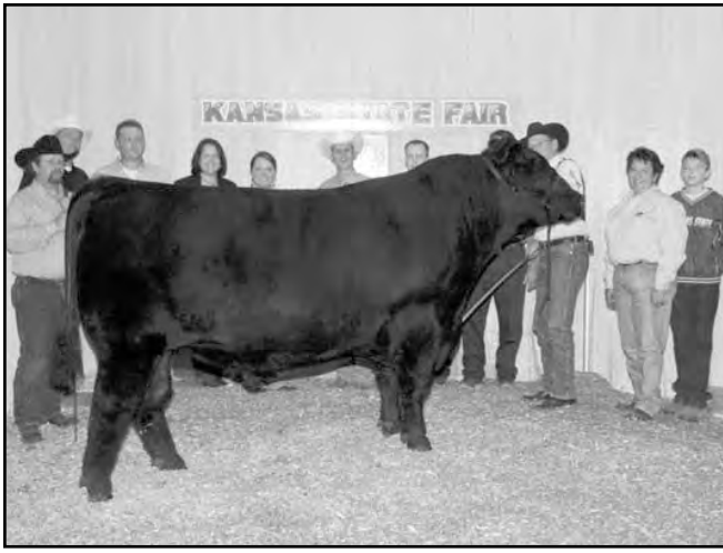
Sankey's 6N Ranch, Council Grove, owns the overall supreme champion bull shown at this year's Kansas State Fair open class beef show in Hutchinson.