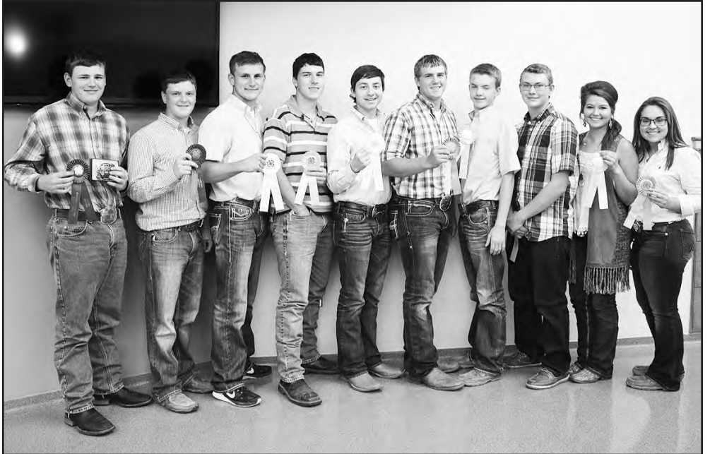
The above students placed in the top ten in the Kansas 4-H Livestock Sweepstakes.