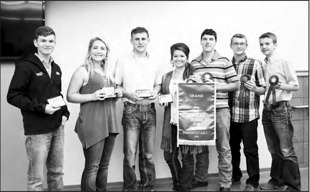
Pictured is the Southwind District team that won first place in the Kansas 4-H Livestock Sweepstakes held Aug. 20-21 in Manhattan.