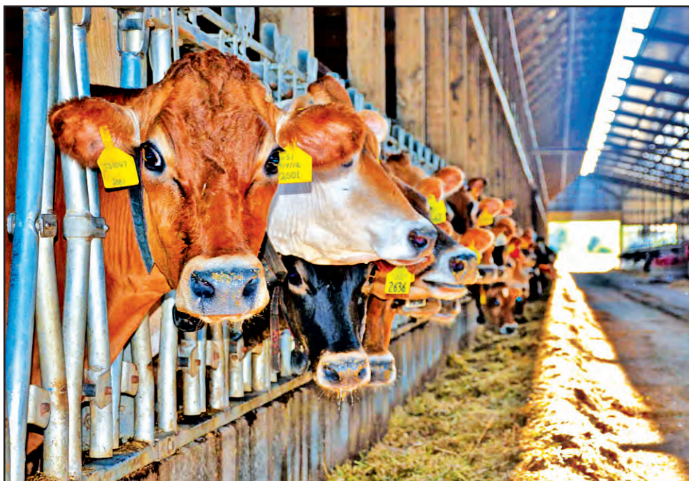
Improved herd health has been one of the benefits of the robotic milkers, with fewer instances of abscesses, ulcers and foot rot. The cows can be milked whenever they want to, up to six times per day.