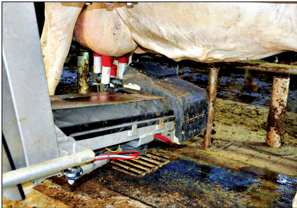
Twelve Lely Astronaut robotic milkers have allowed Meier Dairy to decrease their work force while increasing milk production.

Looking ahead, the Meiers are happy with the advancements they have made with the robots and other technology on the farm such as an automatic mist system to keep the cows cool, and the Juno, another Lely product that resembles a giant roomba, which travels a track around the barn and pushes feed up to the feed bunk for the cows. Finally settling in with the new routine, each family member has responsibility on the farm and a unique way to contribute. By investing in their farm, Meier Dairy hopes to continue on into the fourth and fifth generations.